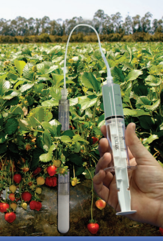
Figure 3. Using 1909L and 1930 to collect a pore water sample in a strawberry field. This sturdy sampler can be capped during the off-season, and then collected from quickly after watering events during the growing season!